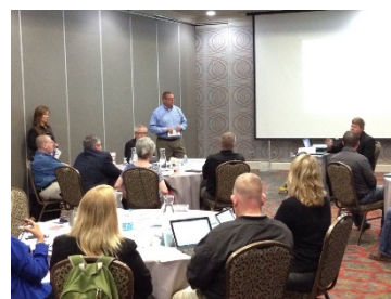
Kansas 911 Coordinating Council meeting, October 17, 2016 Wichita, Kansas