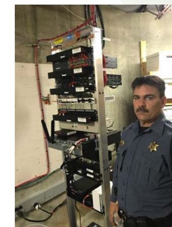
#52 Ottawa County Sheriff Keith Coleman is live on the Council's call handling system.

The fire was jumping roads but with the map they were able to accurately pin-point locations. At one point a woman was in the Sand Hills State Park on a hiking trail with smoke all around her. She was having difficulty getting out and she felt her life was in danger. The map helped the dispatcher guide her back to a main road and away from the fire where she was picked up safely. Once the fires were dying down they were able to use the map to determine addresses for homes or properties that had been damaged or destroyed.