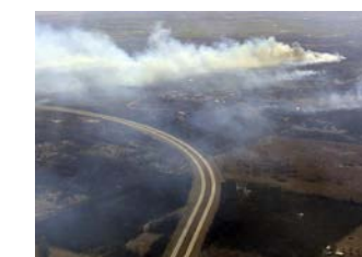
Hutchinson Fire March 2017