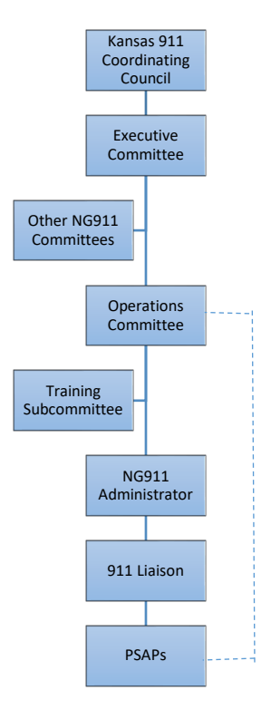
Figure 1 Operations Governance Relationships

Figure 1 is a graphical representation of the governance relationships.