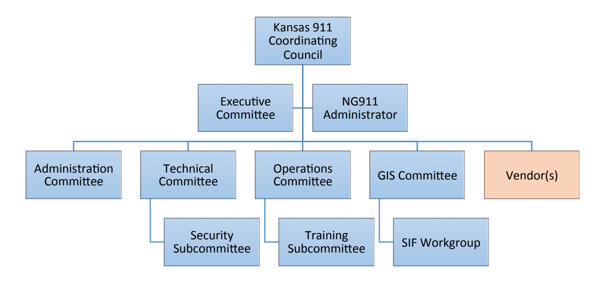
Figure 1 Kansas NG911 Change Management Hierarchy

Because each Committee (Admin, Operations, Technical, GIS) has different roles and responsibilities, each has developed their own Change Management (CM) policy. Each CM policy is slightly modified and tailored to manage within their respective circle of influence. Nevertheless, each CM process is completely compatible with our overarching NG9-1-1 Change Management Plan. Therefore, each CM process must be applied in the context of the NG911 CM Plan as shown in Figure 1.